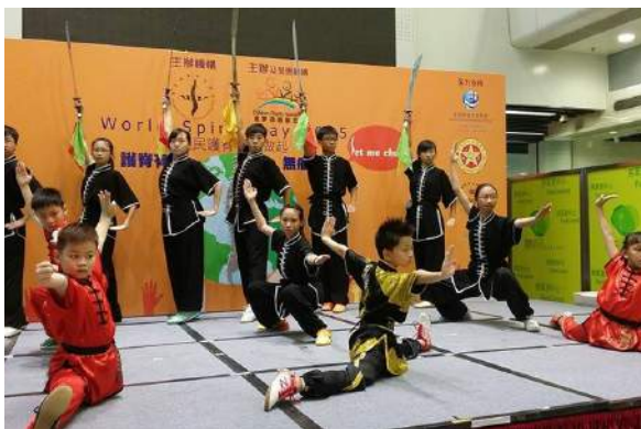
Martial arts groups demonstrating the benefit of exercise to spinal health.