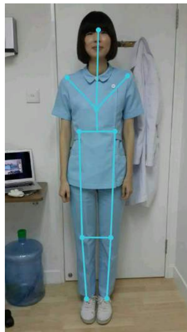
Development of a Posture App