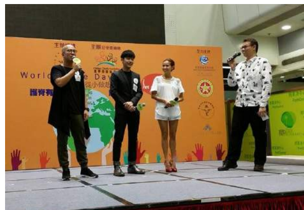
Celebrities Don Li, Eddie Pang and Race Wong talk about the importance of posture.