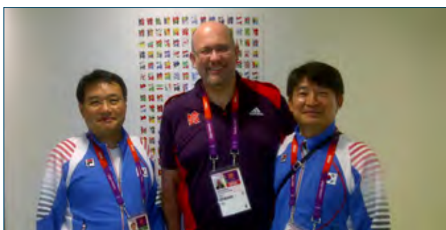
Giving the Korean team's medical directors a tour of the Polyclinic.

presence was at the Games, and that his career would have been far shorter than it was had it not been for chiropractic.